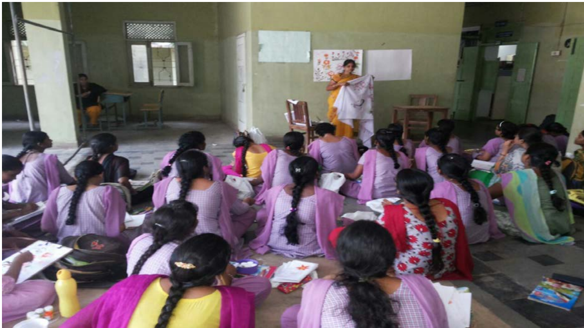
Students practicing the painting skill