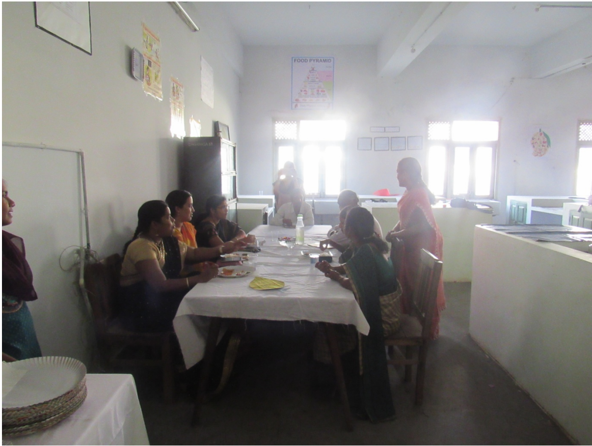
Staff of DKW relishing delicious food items in Nutrition Lab