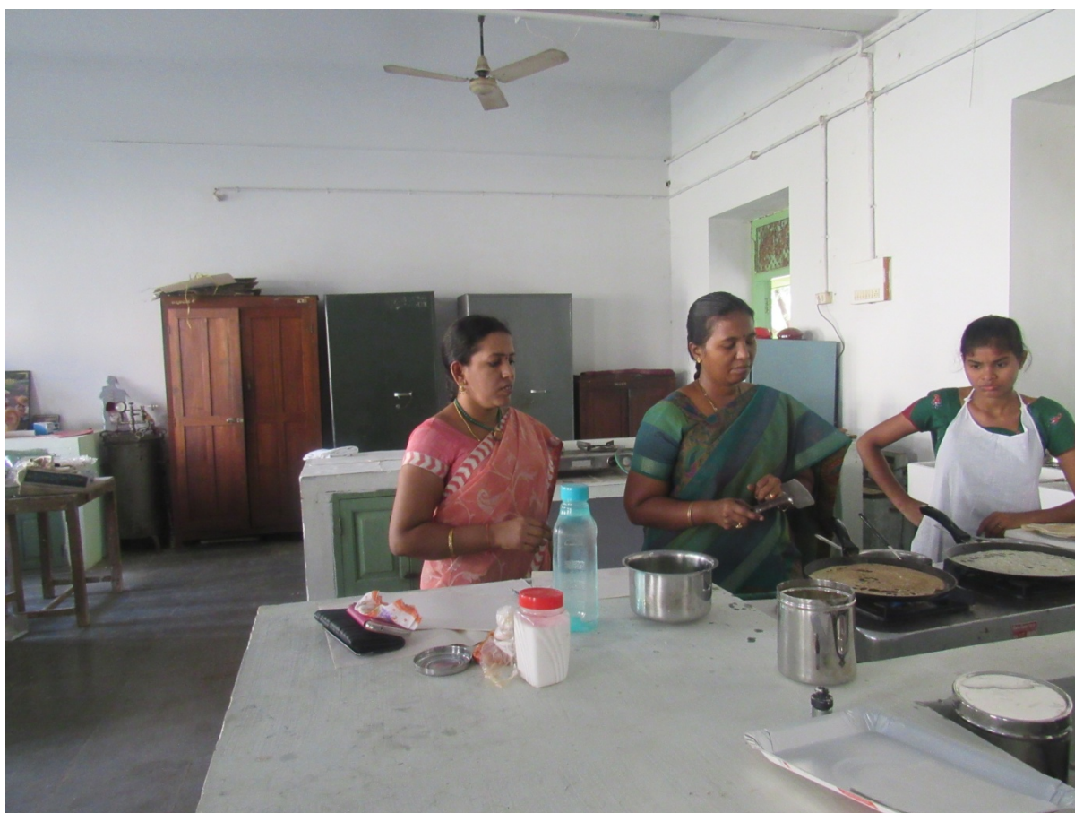
Staff guiding students in Dosa festival