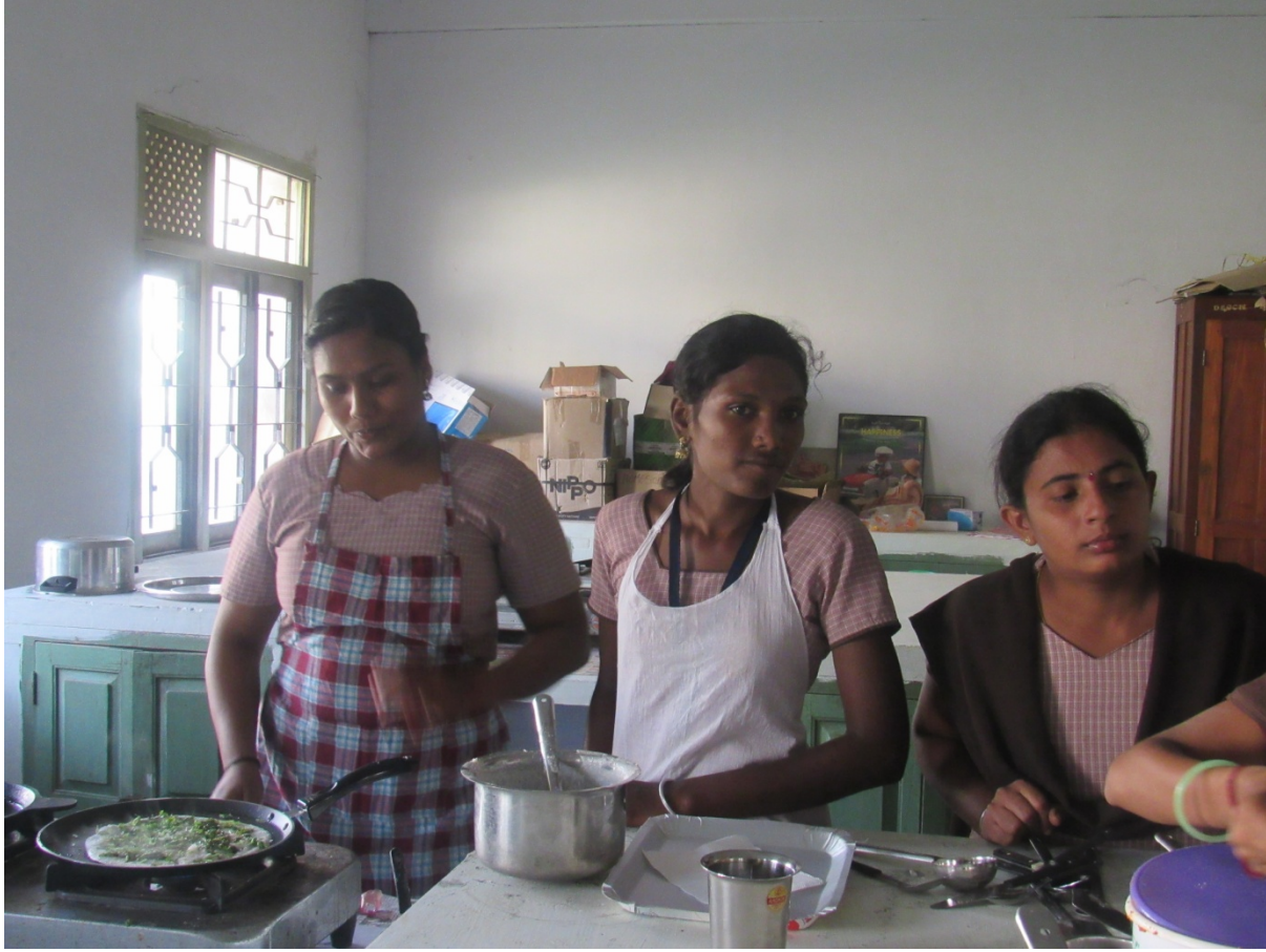
Students making aakura dosa