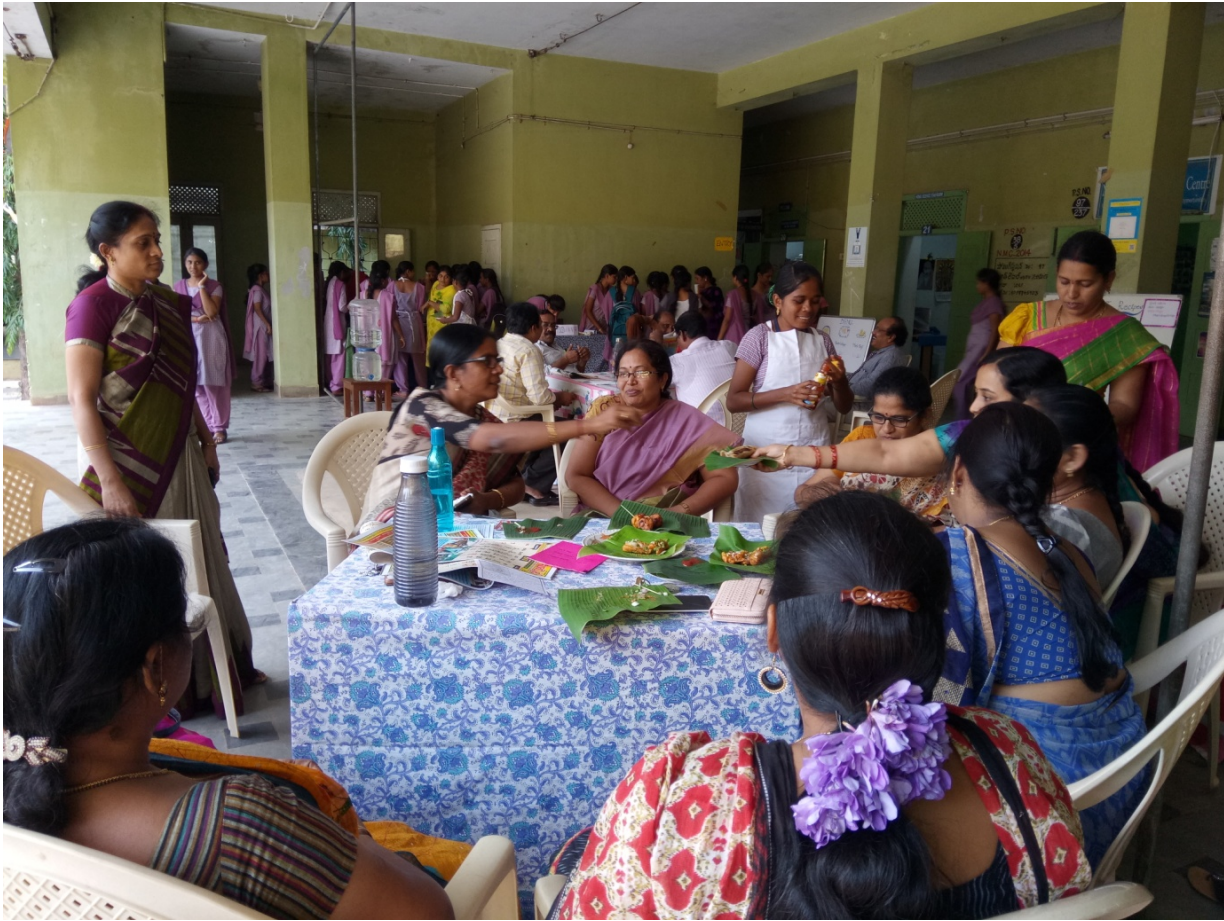
Staff enjoying delicious items