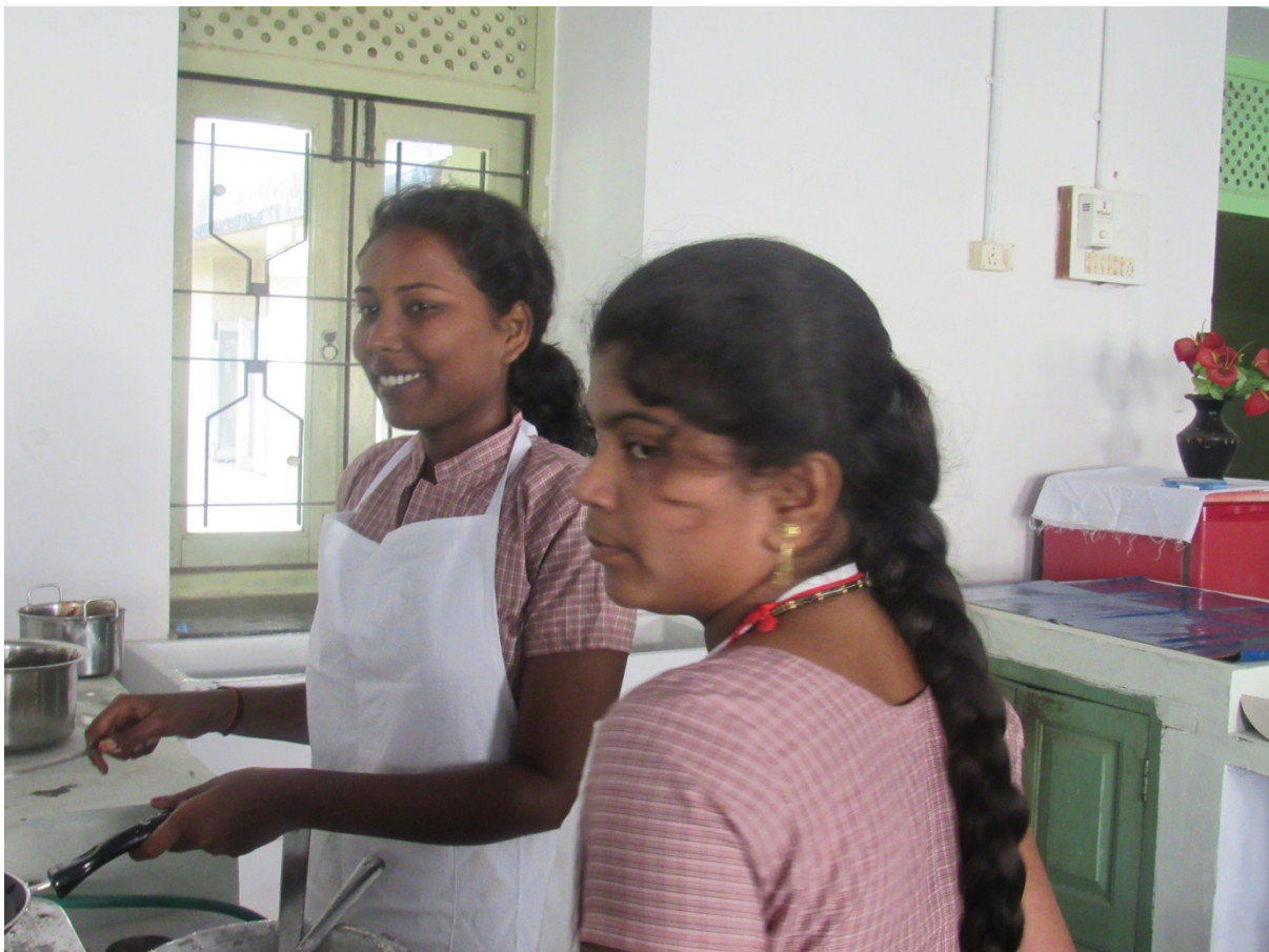
Students working for dosa festival